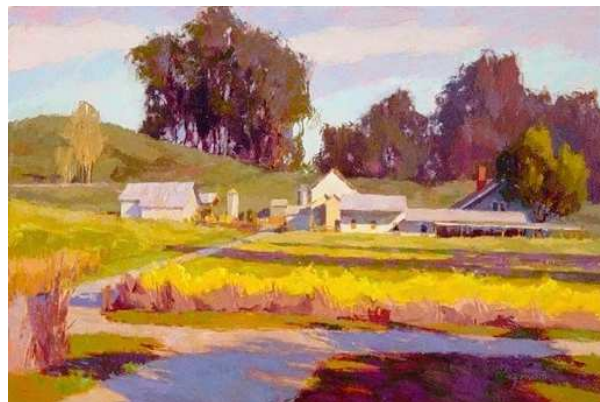
"AFTERNOON MUSTARD" by Camille Przewodek, Oil, 24 x 36, $8000